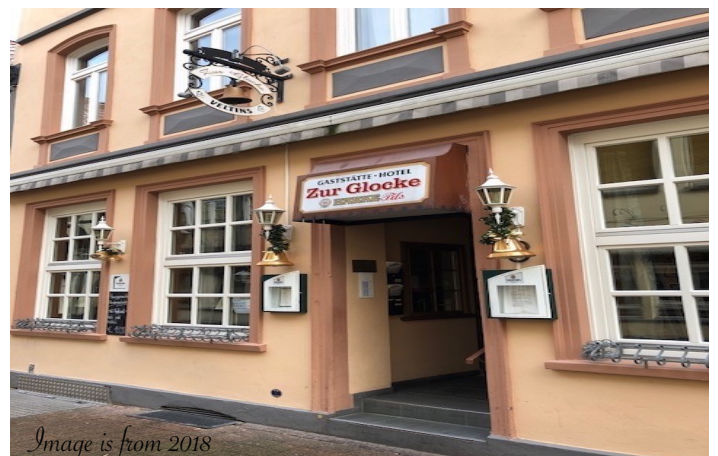
Image is from 2018

On December 17, 1996, this house was awarded a certificate of honor by the Härke brewery for 75 years of customer loyalty